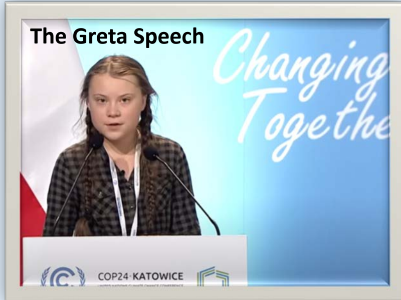
COP 24 in Katowice, Poland

https://youtu.be/VFkQSGyeCWg?si=RYjLgkjsYgnvy_D8